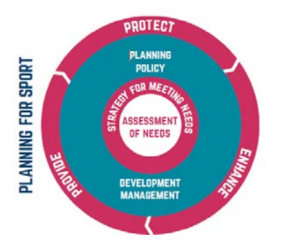
Figure 3.1: Sport England planning objectives